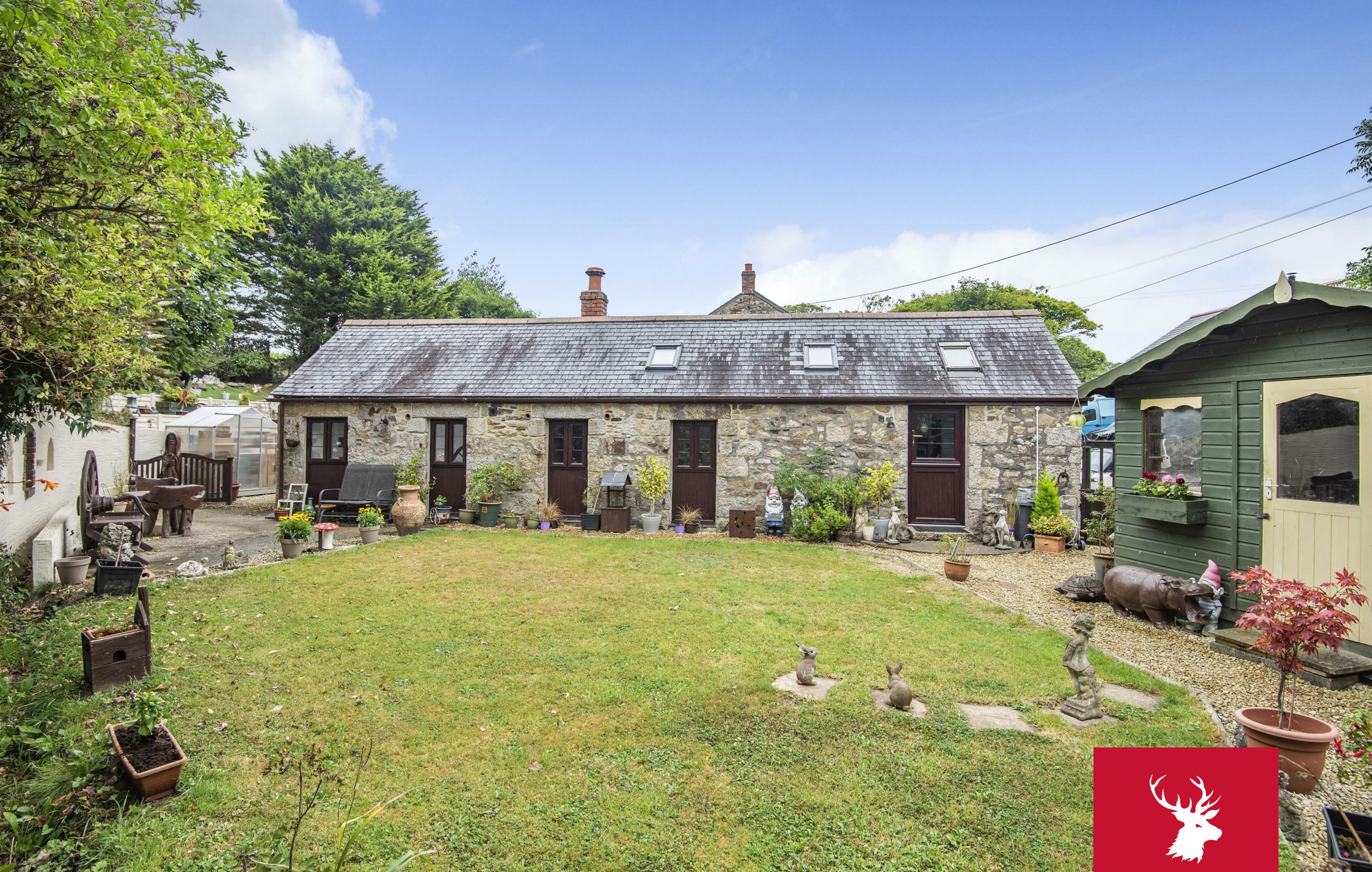
Godolphin Cottage Deveral Road